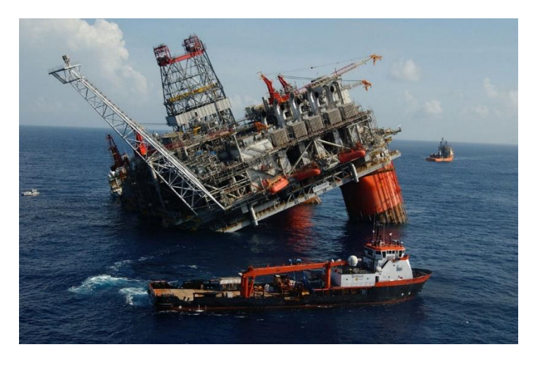
Picture 2. Illustration of the consequences of a securitycompromised offshore facility (oil platform)