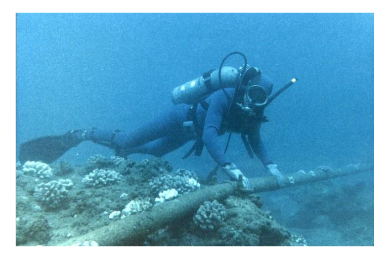
Picture 3. Diver during inspection of underwater cable

Sabotage activities of undersea cables can affect critical economic and financial national and interstate affairs. Also, undersea cables can be vulnerable to intelligence and espionage actions by states, groups, and individuals by compromising electronic data, and those activities are a threat to political stability and order of states and they can compromise international relations (DNI, 2017) ; (Matis, 2012).